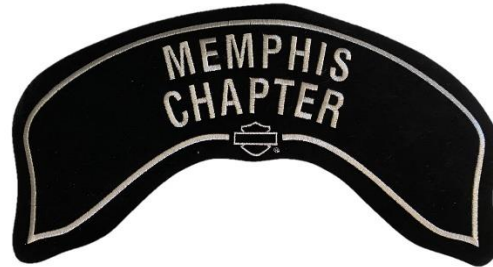
Memphis Chapter Top Rocker Available in Gold and Silver Small $13.00 Large $24.00