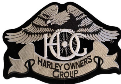
HDG Heritage Logo Small $6.00 Large $15.00