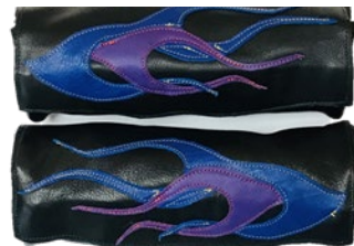
Bags, Bags, and More Bags

Traditional styles and designs or ones to complement your bike