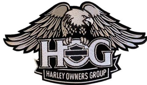
HDG Logo Available in Full Color and Silver Small $6.00 Large $15.00