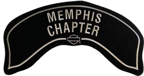
Memphis Chapter Top Rocker Available in Gold and Silver Small $25.00 Large $40.00