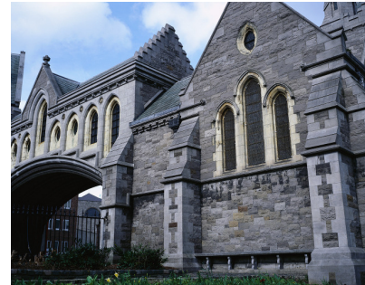
Christ Church Cathedral, Dublin