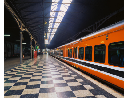
Heuston Station, Dublin