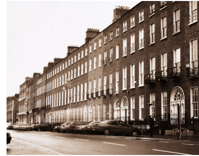
Merrion Square, Dublin