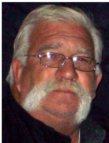
by Joe Moscon