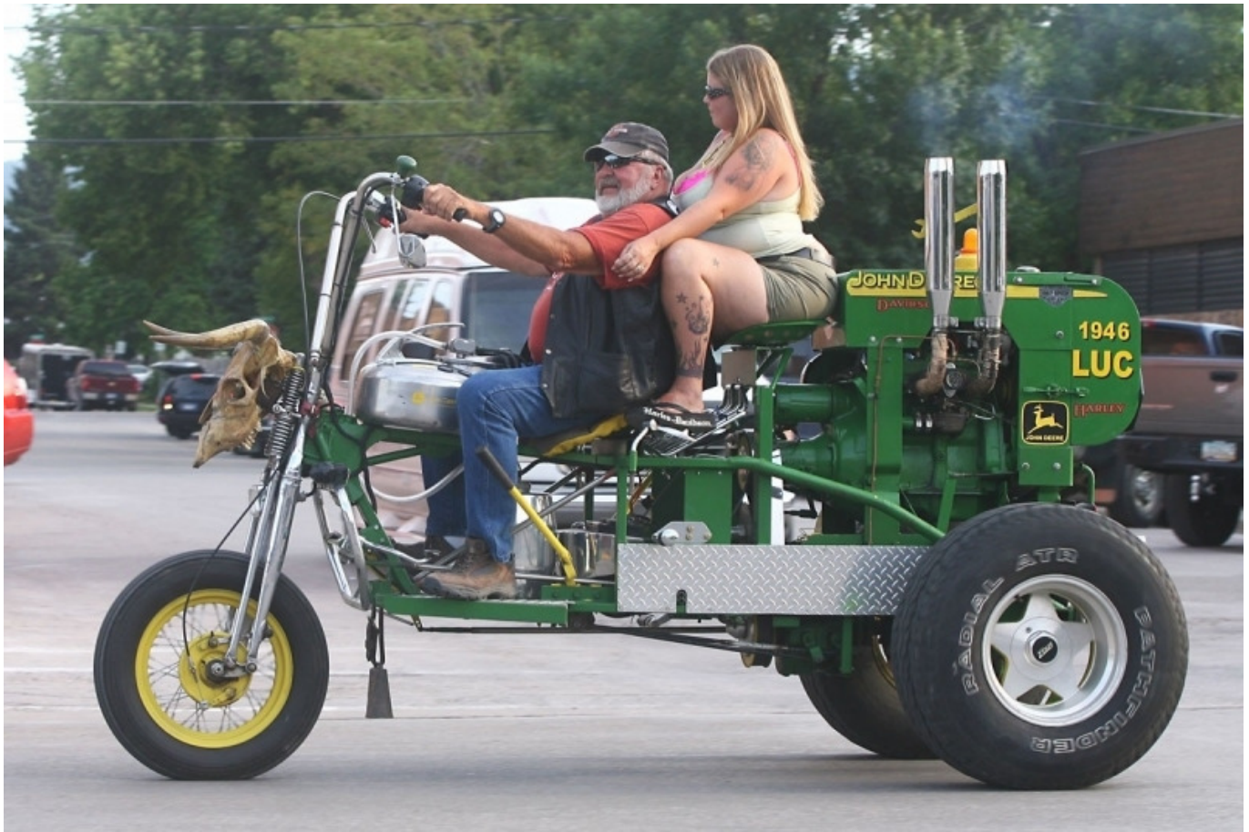
"Take Me to the River, Daddy!"