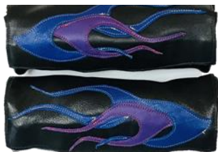
Bags, Bags, and More Bags

Traditional styles and designs or ones to complement your bike