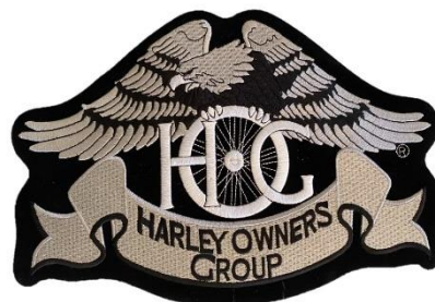
HOG Heritage Logo Small $6.00 Large $15.00