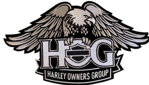
HOG Logo Available in Full Color and Silver Small $6.00 Large $15.00